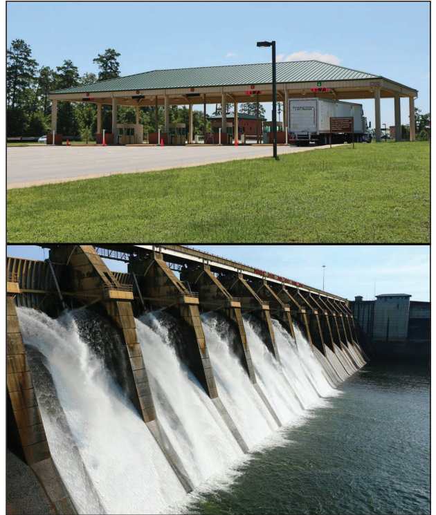
Electronic Security Center provides worldwide support for military programs and civil works.

The ESS PDT utilizes multiple contract vehicles to competitively acquire products and services using streamlined acquisition processes. The contract vehicles utilize a pre-qualified pool of contractors that perform to meet USACE and industry standards, in compliance with Unified Facility Criteria. The primary contract vehicle currently being used for ESS efforts is the ESS VII Multiple Award Task Order Contract which has a contract capacity of $675 million. The ESS VII MATOC includes multiple small and large business contractors experienced in designing, installing and maintaining ESS.